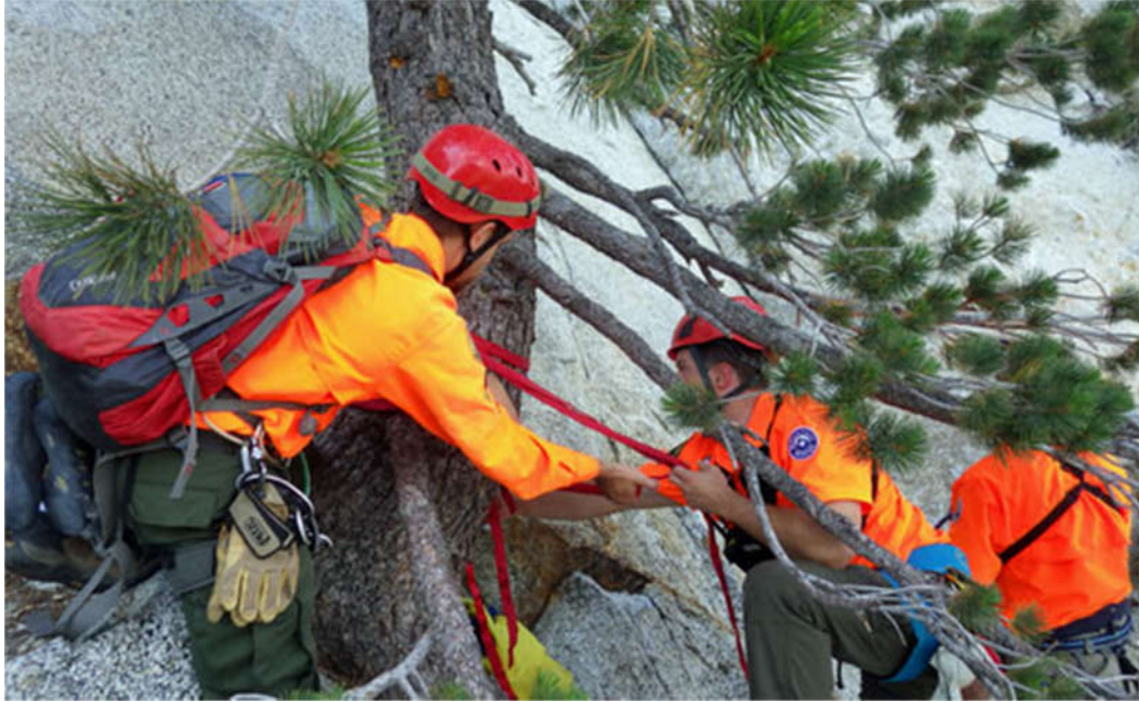
Wrapping a Tree as Anchor

We set up an anchor on a tree and attached a rope and got the litter up to near the climber. We then had to wait for the Coroner and a Deputy who arrived around noon. Once on scene we belayed the Coroner up the Third-Class terrain to the climber where she examined the body and all the loose gear and took lots of photos. The Rescue members then gathered up all the loose gear into a bag. With the Coroner's help, we prepare the climber to be loaded into the litter.