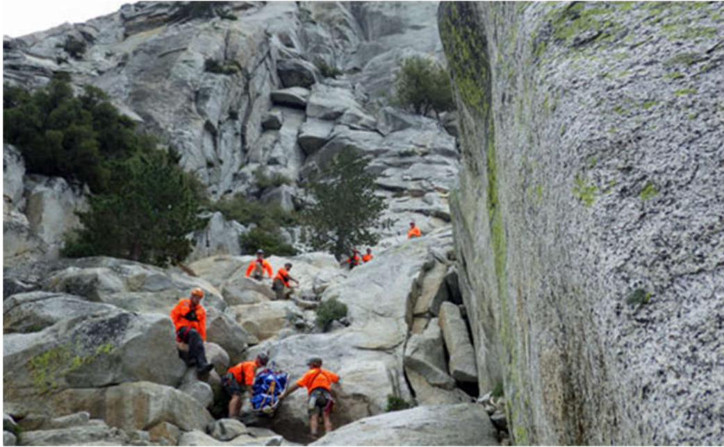
Lowering down Third Class to Trail