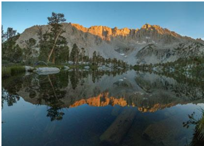
University Peak right high point skyline

We made it to camp at Matlock Lake just before sunset to watch the alpenglow on University Peak and its crystal-clear reflection on the lake.