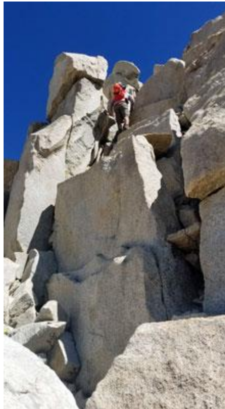
Kase Climbing 3 rd class summit Mt. Gould by Eric.

Another group headed up to Kearsarge Pass and scrambled up to Mount Gould at 13,005' which has a class 3 summit block, (Eric and Kase).