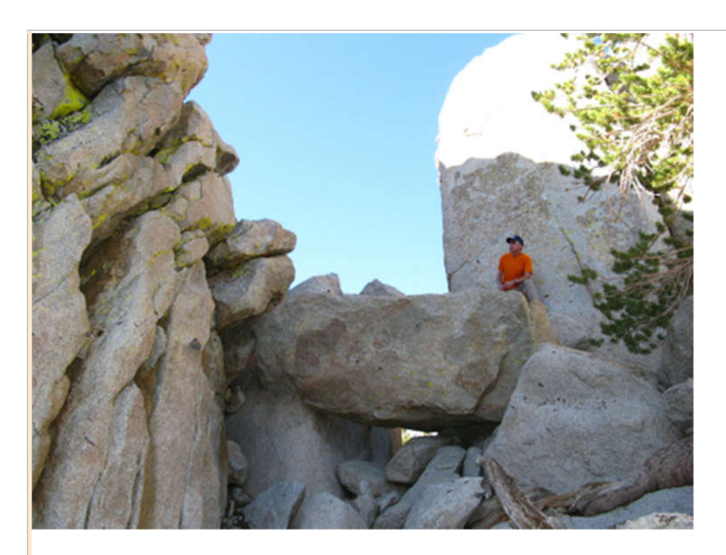
A view from the trail dropping down into saddle Junction