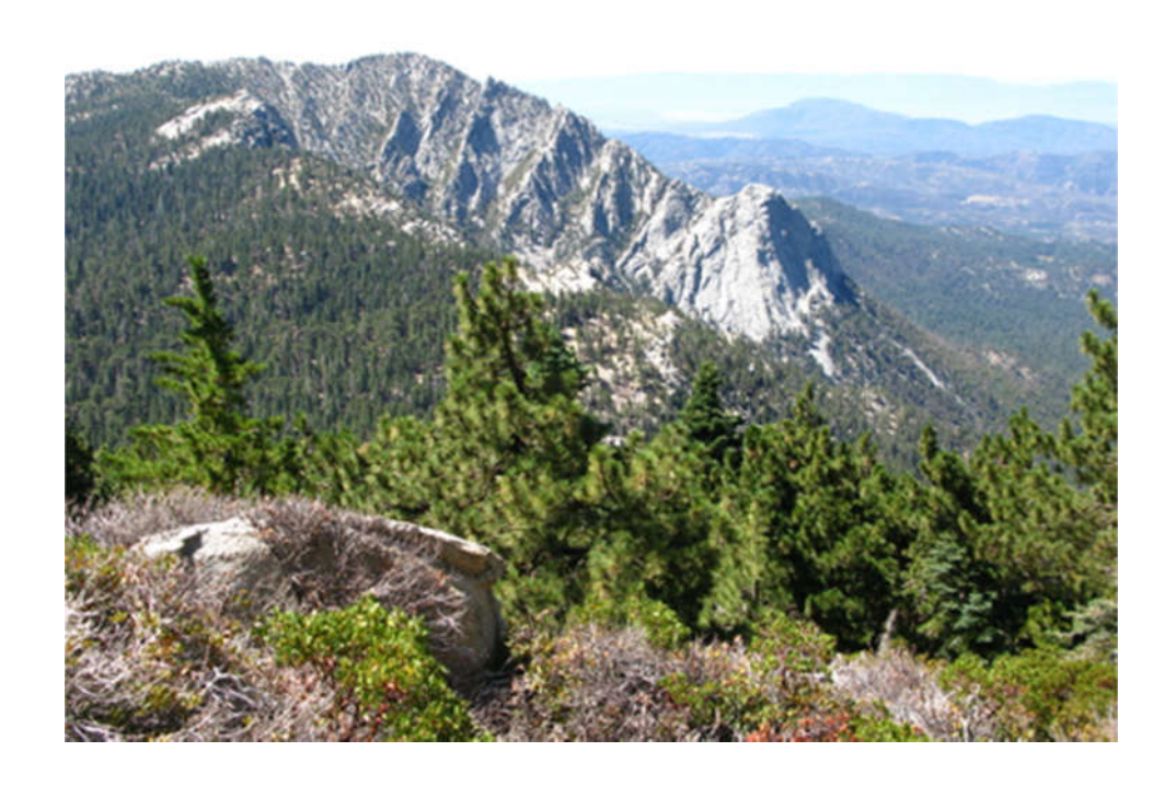
My Mountain Familiarization Training from Idyllwild to the Peak