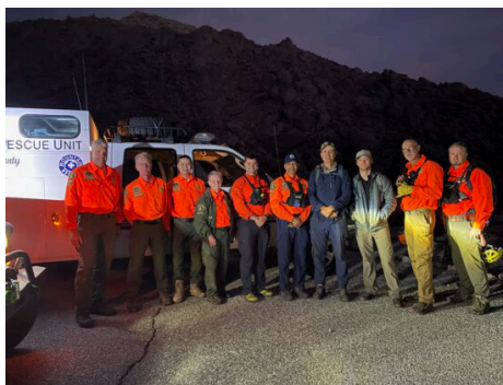
RMRU Team Members with rescued subjects

At approximately 2230 hours on 10/23, a callout was initiated via Mission Manager for members to respond to the Pacific Crest Trail Snow Creek trailhead in White-water, California for three missing hikers who were last heard from at 1545 hours that afternoon.