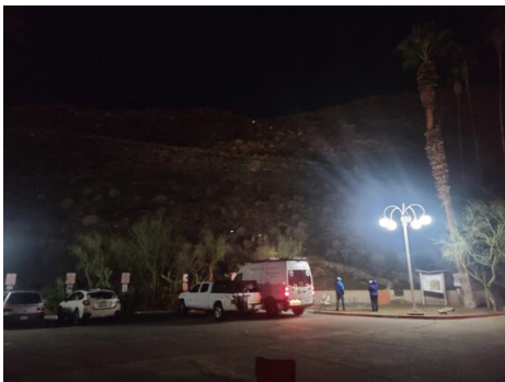
Vinay and Blake bringing the subject down the skyline trail.

The end of 2021 brought the RMRU team a flurry of rescues on a popular trail that leads from the Palm Springs Desert Museum to the Upper Palm Springs Tram – the Skyline Trail (C2C).