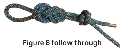
Figure 8 follow through