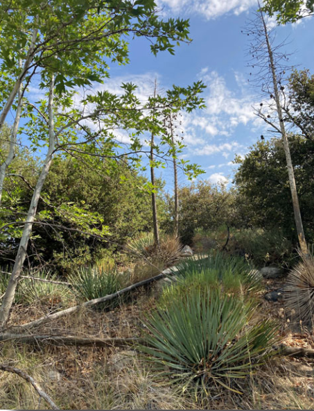
The area the missing man was found.

Our intention was to grid it as thoroughly as possible. On arrival we gained the ridgeline easily, finding tracks from the posse, and confirmed that the multiple searches in the area hadn't covered the slopes of this ridge, an area of about 500 feet by 1000 feet. Reaching the end of the ridge farthest from the vehicle, we decided that we would follow contour lines zigzagging back and forth until we reached the base of the ridge, and then ascend to start again in a new area. James headed west and I headed east.