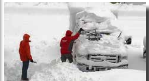
18 inches of snow overnight

recertification. We headed back to our condo to clean up and relax for the evening and have a good meal. The next morning, we awoke to over 18 inches of new snow covering the ground outside. After a great breakfast cooked for us by Eric we started digging out the vehicles so we good head home.