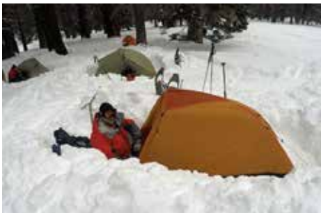
Tent Setup in Fresh 3 - 4 foot deep snow

We rode up the Tramway on the 7:30 pre-public car with the State Park Rangers and Volunteers. The purpose of this training is for new members to try out their winter equipment and for old