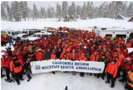
Group Photo of Participating California Region MRA Teams

We drove up to Mammoth on Friday for the annual California Region Mountain Rescue Association recertification. This year's re-certification was snow and ice; Technical Rock and Tracking in other years.