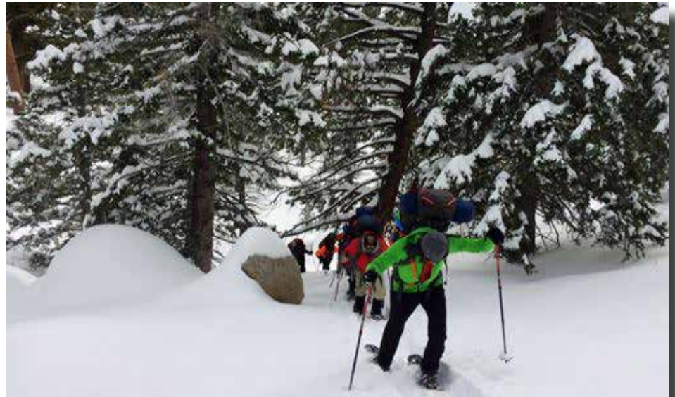
Snowshoeing up hill in fresh powder snow near the saddle between

the tents for the night. Winter nights get cold in a hurry and seem to last a long time. By 7am we were getting up and cooking breakfast before continuing training. We were out in the valley practicing avalanche probing in a line when the call for the first mission of the year came in Lost Skier out of the Tramway.