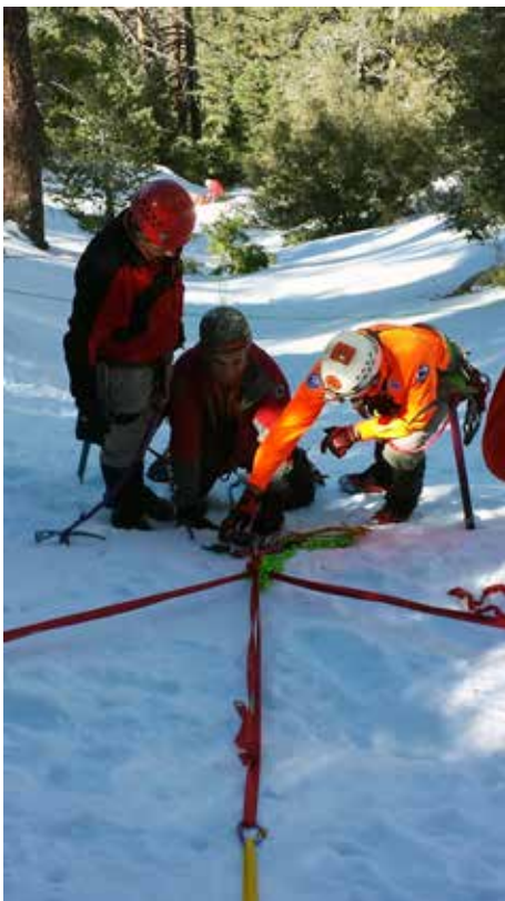
Equalizing Anchor System Subject and sled far below

In this day's training, the objective was to refresh ourselves on our winter rigging system operations, general safety, medical personal training, use of ice axes (personal anchors, self-arrests) and proper