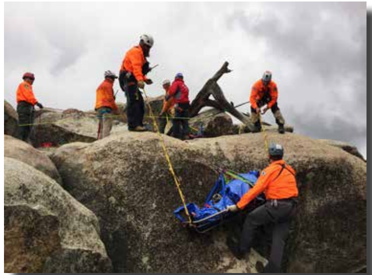
Subject being raised up cliff

On Saturday Riverside County conducted its first Joint SAR exercise in years. The training scenario consisted of a fictitiously downed aircraft in the mountains around Garner Valley with four dead, injured, and lost personnel that needed to be rescued and recovered.