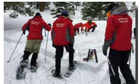
Snow Anchor Practice