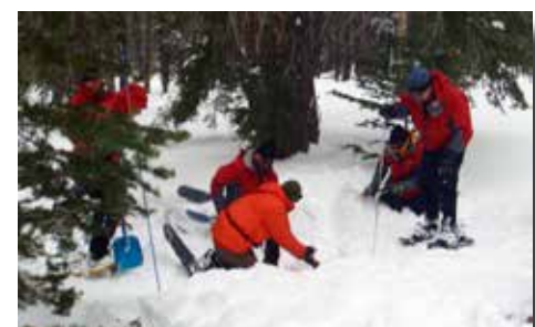
After using transponder to find subject - digging out