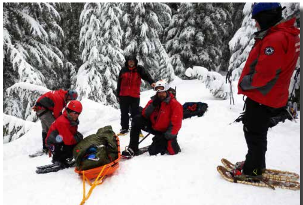
Subject prepared to lower. MRA Evaluator standing at right

As we lowered the subject down the snow slope out testers said we