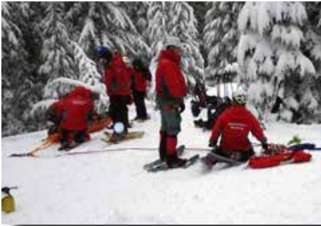
Snow Anchors - Final Inspection

had reached point where we needed to raise the toboggan up 10