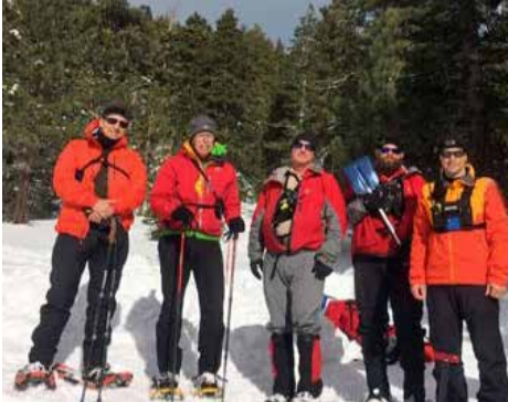
Search Team Members about to begin search on snowshoes