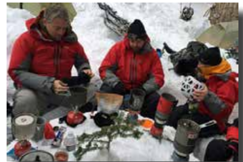
Snow Cooking and Meal Station

In the late afternoon we then got out our avalanche transceivers and showed everyone how they worked. We then had one person bury one and the rest of us started