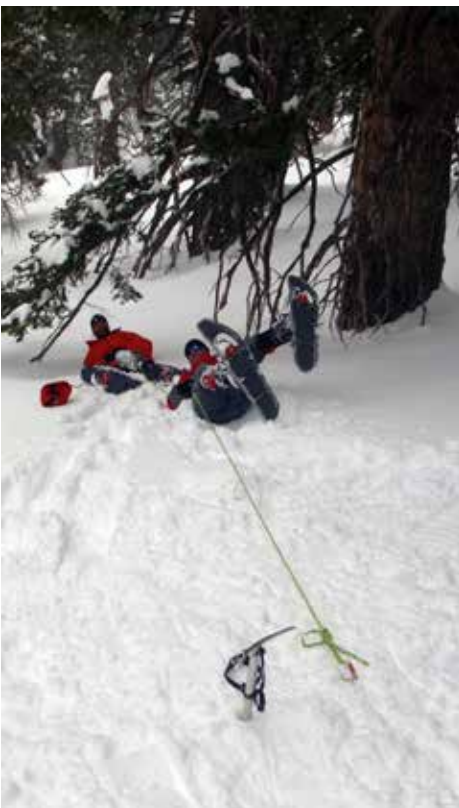
Testing a Snow Anchor to Failure (it didn't fail)

Then it was time for dinner around the table. We built a round table and dug out around it so we could sit 10 members around the table to cook and eat as a group. This worked out well until the sun went down and everyone headed into