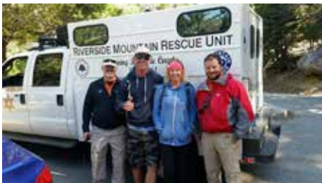
Kirk, Subjects, and Ray at Base - Humber Park

Star 9 returned to the scene once the subjects were located and airlifted them to Keen Wild where the Deputy on scene drove them back to their vehicle at Humber Park. Fortunately for the subjects, the temperatures that evening were mild and there was no wind.