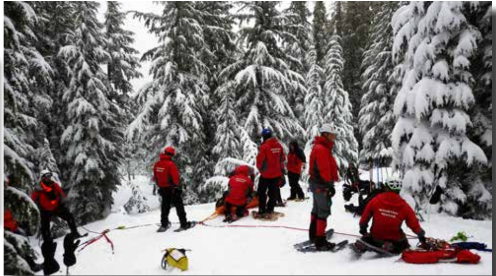
Team Members setting up 2 lower / raise systems

Hiking back to base we were to go over to an avalanche test area to find two buried subjects. The subjects were actually large backpacks with transceivers inside. We quickly got into a search line and turned all our transceivers to search mode