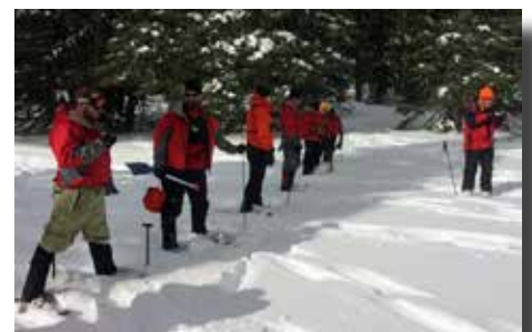
Line-up in preparation to probe for buried subject.

searching for it. We formed a line about 50 feet apart from each other and then walked down the avalanche area until someone's transceiver picked up the signal. We found and dug out the buried transceiver in about 3 minutes. We then repeated the exercise several more times.