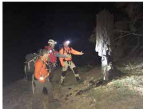
Strange Burned Tree