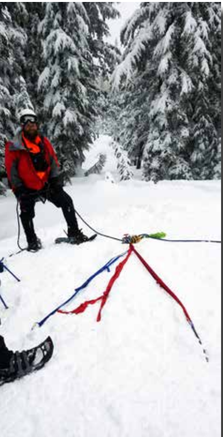
Redundant - Equalized Snow Anchors

feet and move it over to continue lowering. So we quickly switch the lower to a raise and did as we had been asked by the testers. Everything went smoothly and we had the subject back on the road below our test area in no time. This part of the test was now done.