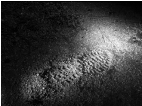
Subject's Footprint highlighted by flashlight

The trail past Hidden Divide has been closed for only three years but there was so much debris scattered about that it was difficult to find in sections. Past Laws junction, the fallen logs, new brush and burned out ghosts of trees everywhere in sight made me recognize how fast nature can reclaim her property. Thereafter, the trail frequently washed out so we had to do some decent route finding.