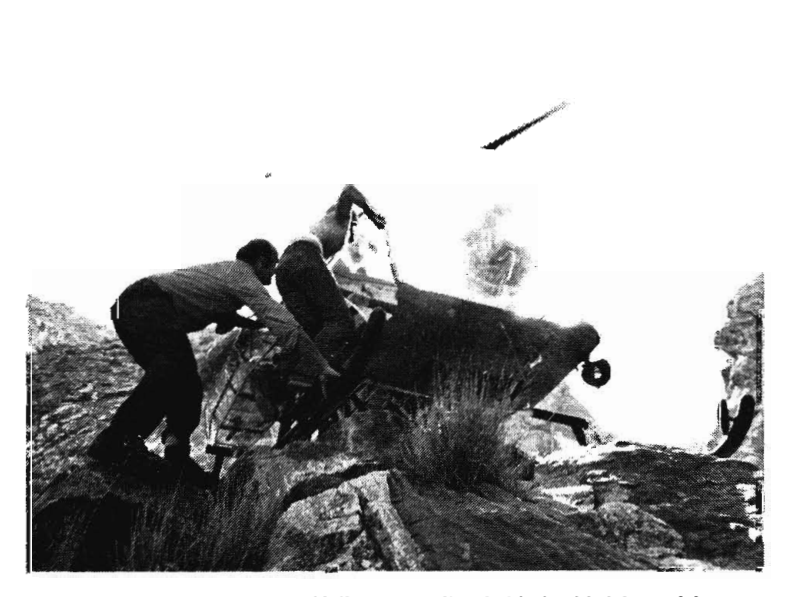
While the Western Helicopters pilot held the bird in a tight spot, Hank Schmel assisted the injured man aboard.