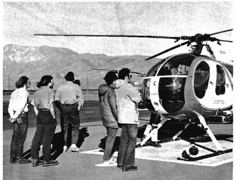
Since we had not worked with the Hughes 500C in the past, everyone took many turns entering and exiting during the static training at the tie down area.