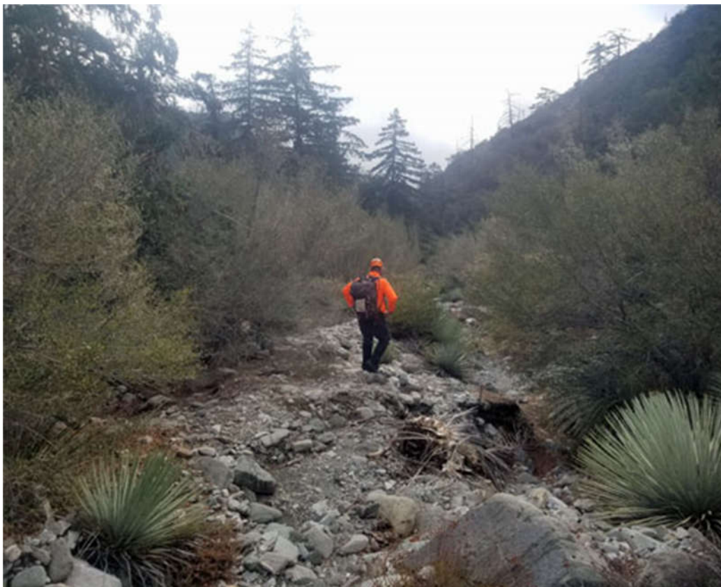
Eric Searching Canyon Bottom.

We hiked to our assignment area by going over Mt. Baldy summit, which was experiencing high winds, almost blowing me over. When we reached the top of our first assignment, we were redirected to a cell phone ping of the subject in a canyon on the east side of the ridge we were on. After searching the nearby area and finding no sign, we went back to our assignment.