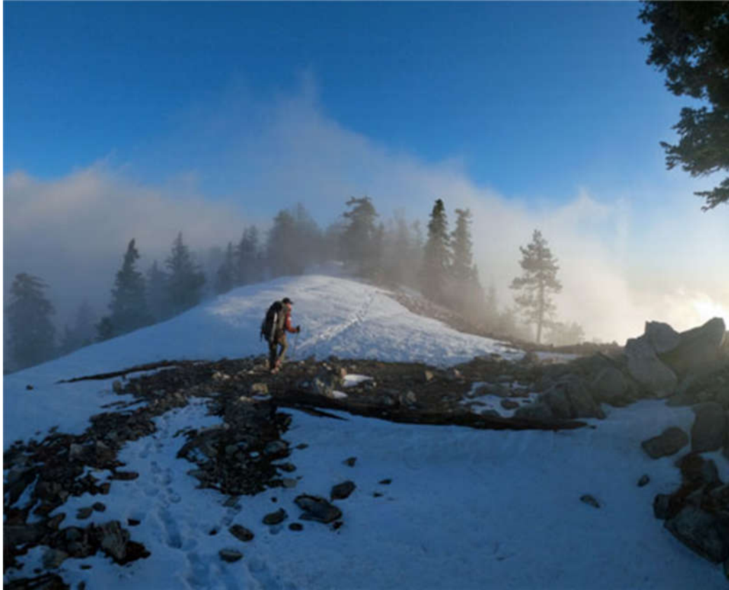
Cameron Searching Bear Flats.

Cameron and I responded at 11:00AM on Monday and were assigned to hike bear Flats Trail to the summit of Baldy. After a difficult first section of the trail which included bushwhacking and crawling under brush from trees that had recently blown over, we approached snowline at 7000 feet. We made our way to about 8000 feet of elevation when we were requested to turn around due to approaching nightfall.