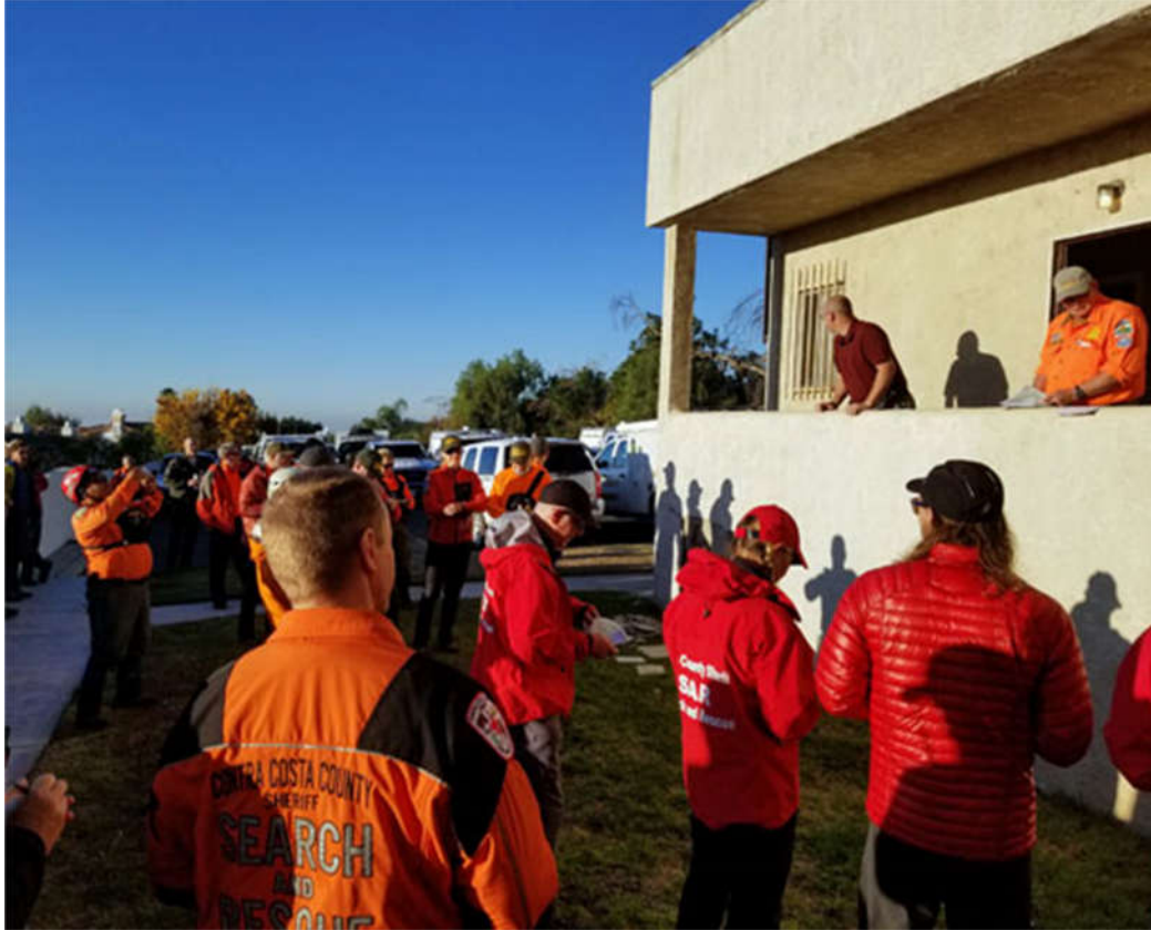
Morning Briefing with over 100 Searchers.