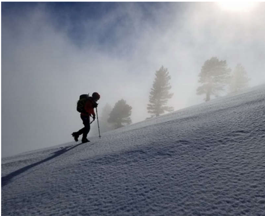
Tyler Searching Near Bear Flats Ridge.

The drainage was narrow and had rapidly melting snow cover. This resulted in significant rockfall, so we agreed the area was too dangerous to search. We moved to the top of our next assignment and assessed it with the same conclusion as the first. There was too much danger from rockfall to complete the assignment. As we discussed the possibility of searching from adjacent ridges, we were called back to base.