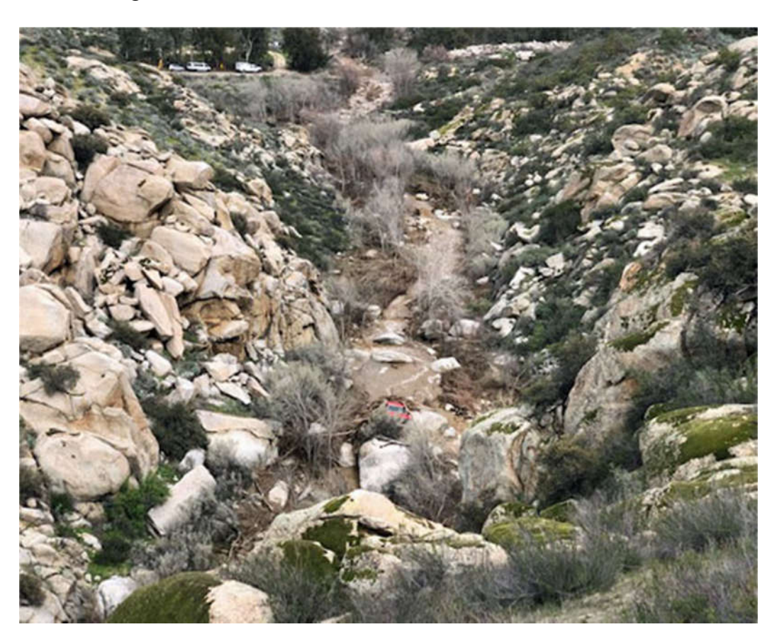
Truck looking back at Road Photo by Shani Pynn.

At roughly 8:30 AM on Friday the team was called out to help with a coordinated search of a recently flooded creek where two vehicles washed downstream from a road crossing. I had just settled in to a nice quiet day of catching up on things at work, but hey, that's how it goes sometimes. So, I checked in with the bosses and headed out towards Hemet to pick up the truck. Josh and Vinay were also responding, and I let them know they would be arriving ahead of me.