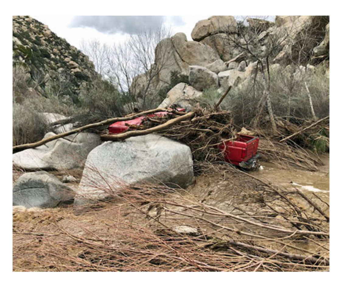
Truck in Wash