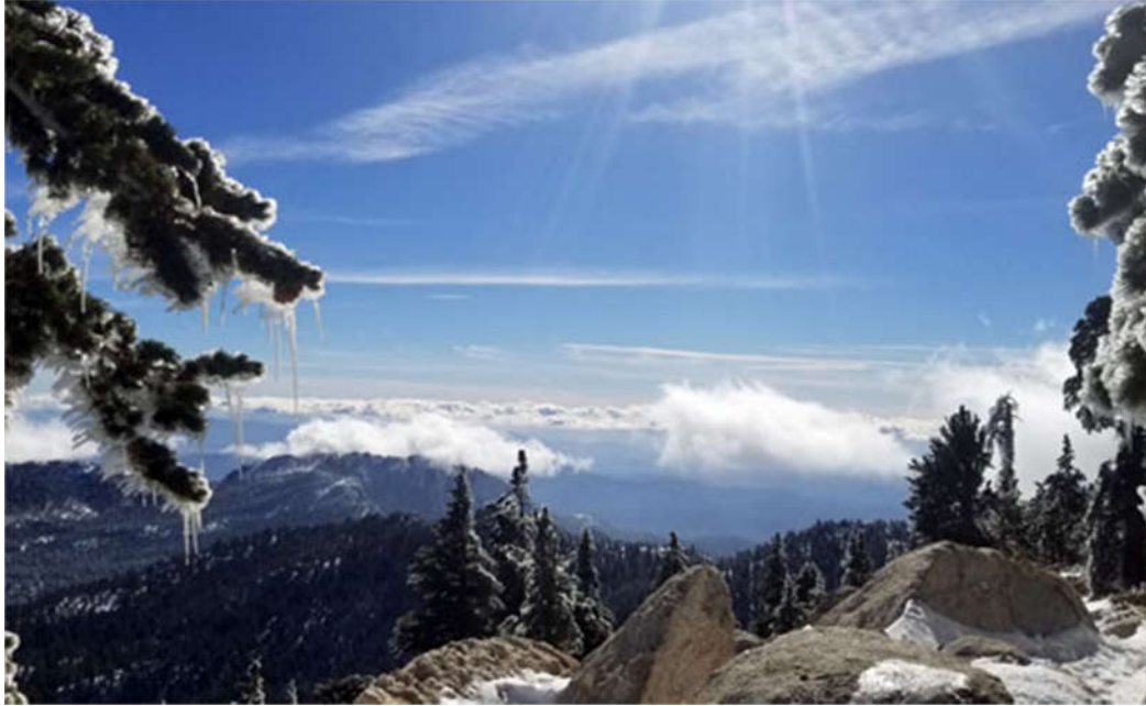
Morning after storm