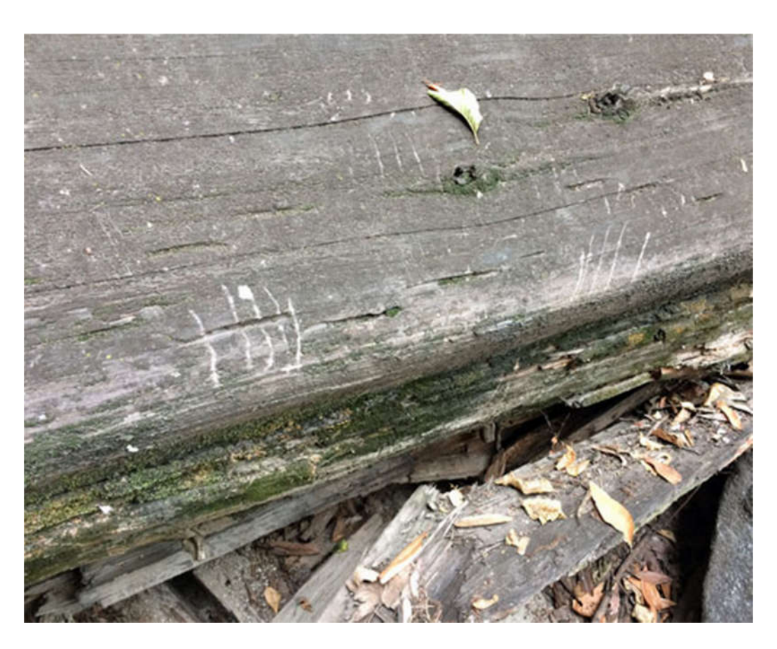
Bear Claw Marks

The upper part of the canyon involved one rappel and one optional rappel that was done by some members of our group.