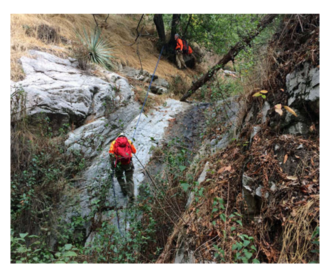
First Repel