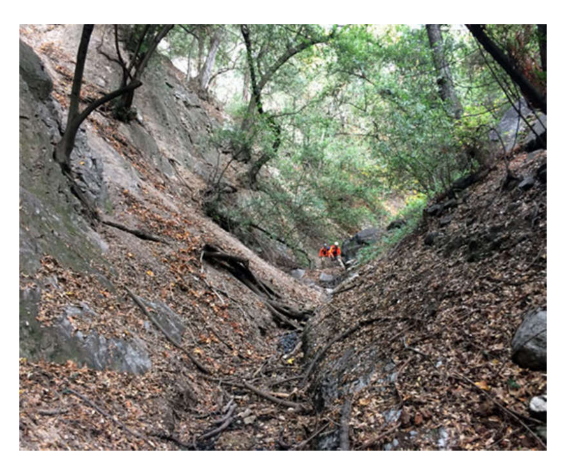
Coming Down Upper Canyon

After a four mile hike up to our drop in point we started down the canyon and quickly ran into many signs of bears such as claw marks, tracks, and scat. We would eventually run into the bear living in the canyon about 200 yards up from First Water.