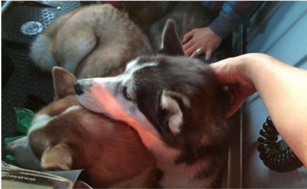
Dogs take Flying in stride