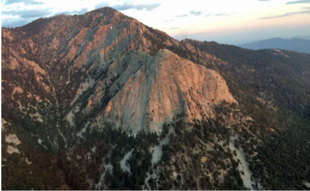
Tahquitz Rock from the air