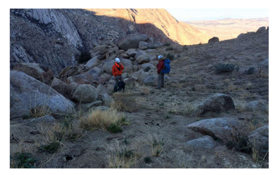
Cameron and Ray waiting for Helicoper

Thankfully, even in gusty winds, the RSO Aviation Helicopter was able to land near us, pick us up, and give us a short ride back to base. The helicopter then had to return to base for the rest of the day due to high winds.