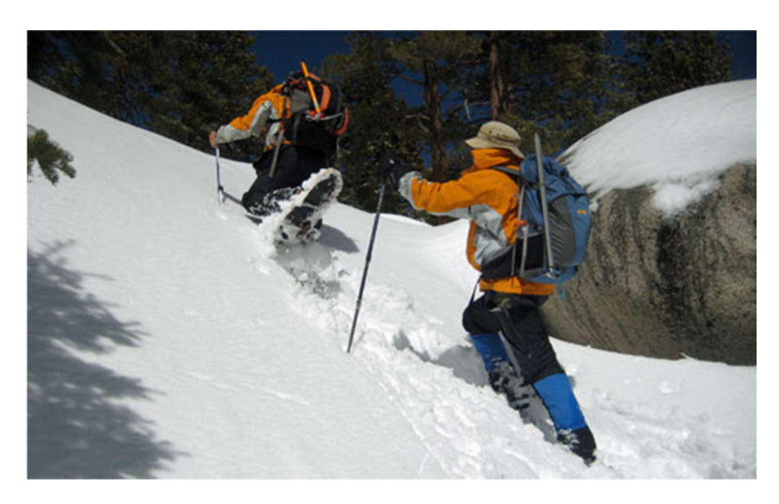
China Lake members ascend to subject

As the day went on several times we thought we had tracks, but they turned out to be animal tracks. Then around 11:30 a.m. the call came over the radio from Team 14 (China Lake) that they had found a snow cave and SOS marked out on the ground next to it. They had a set of tracks and started following them uphill towards Wellman Divide.